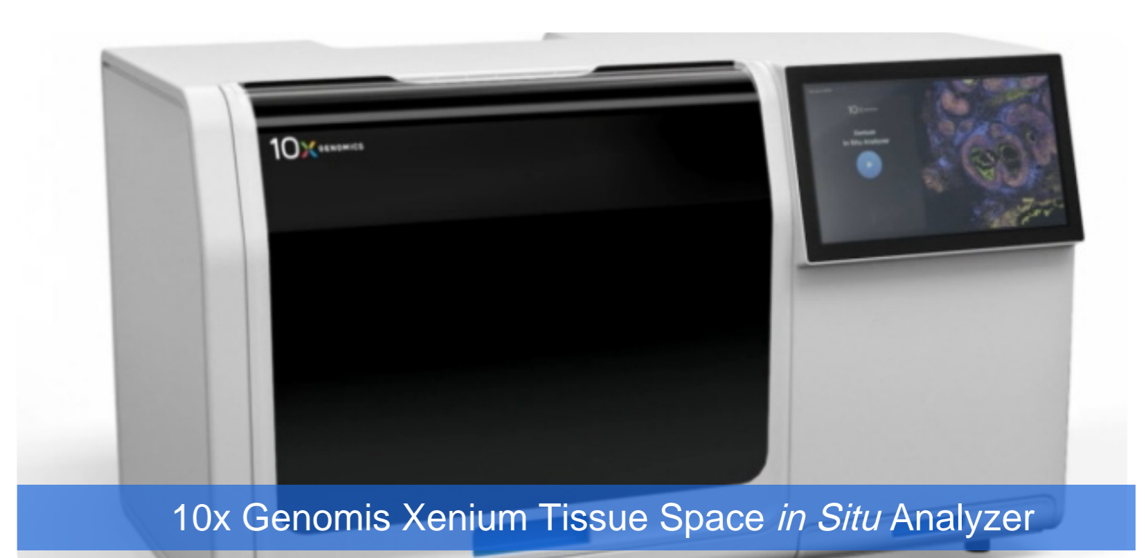
10x Genomics Xenium Tissue Space in Situ Analyzer