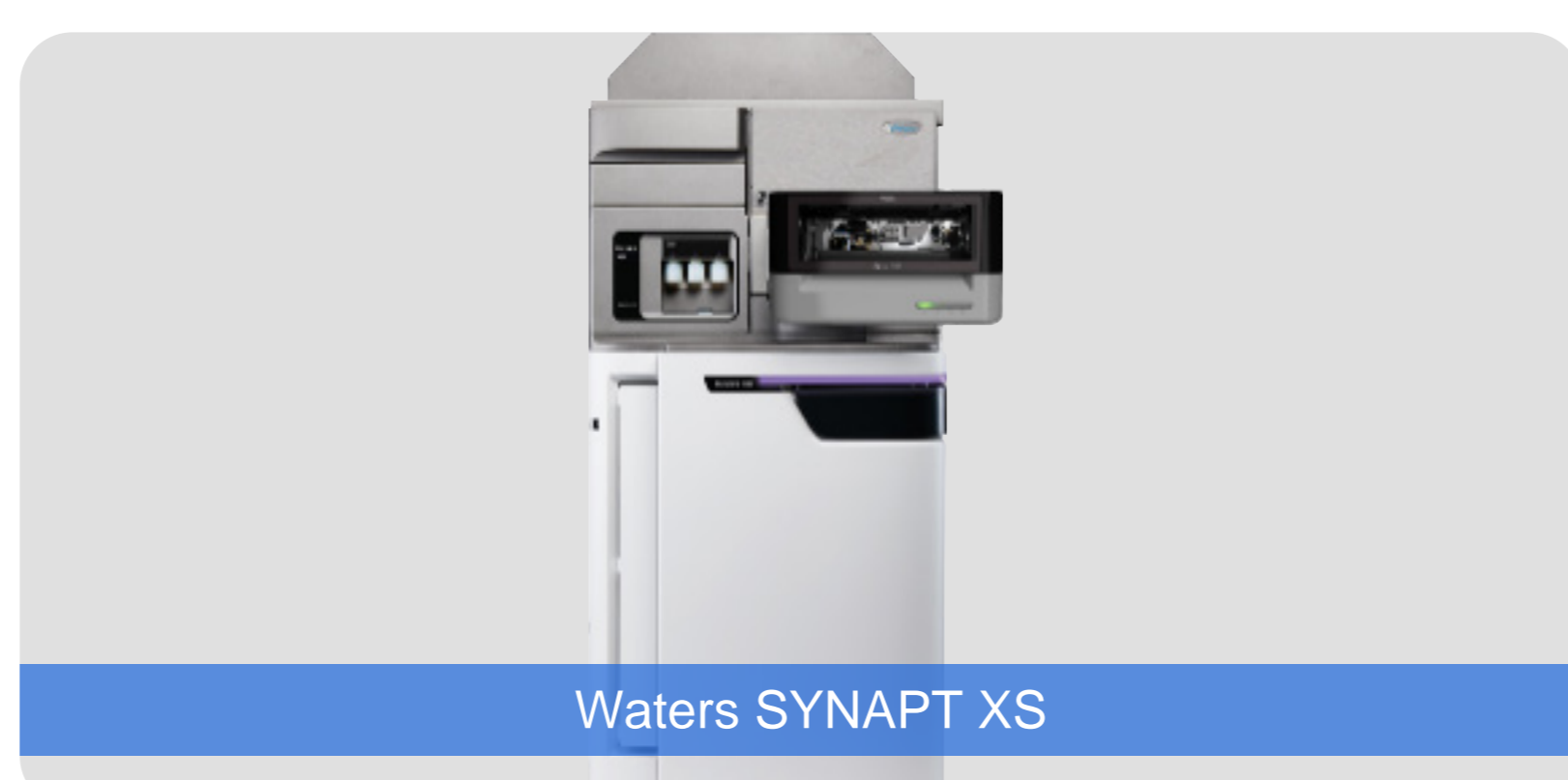
Waters SYNAPT XS