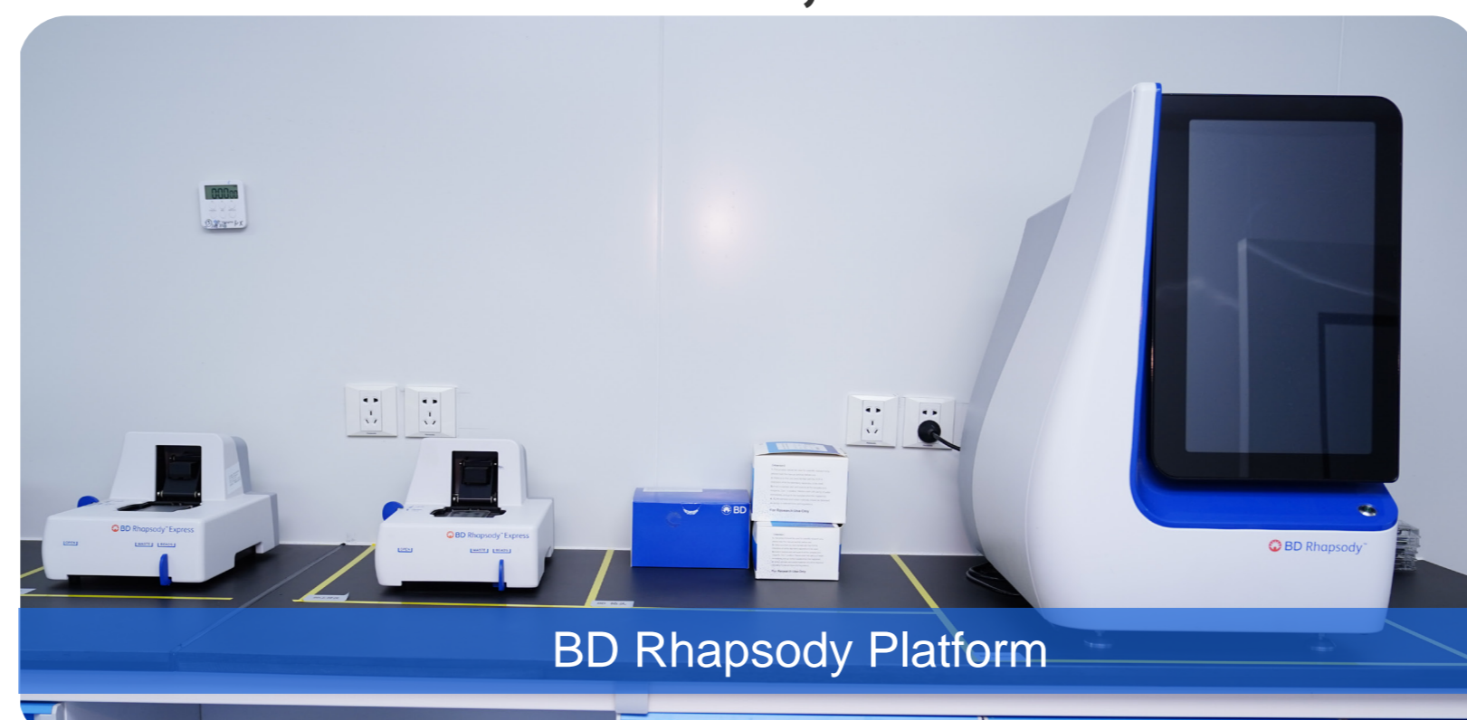
BD Rhapsody Platform