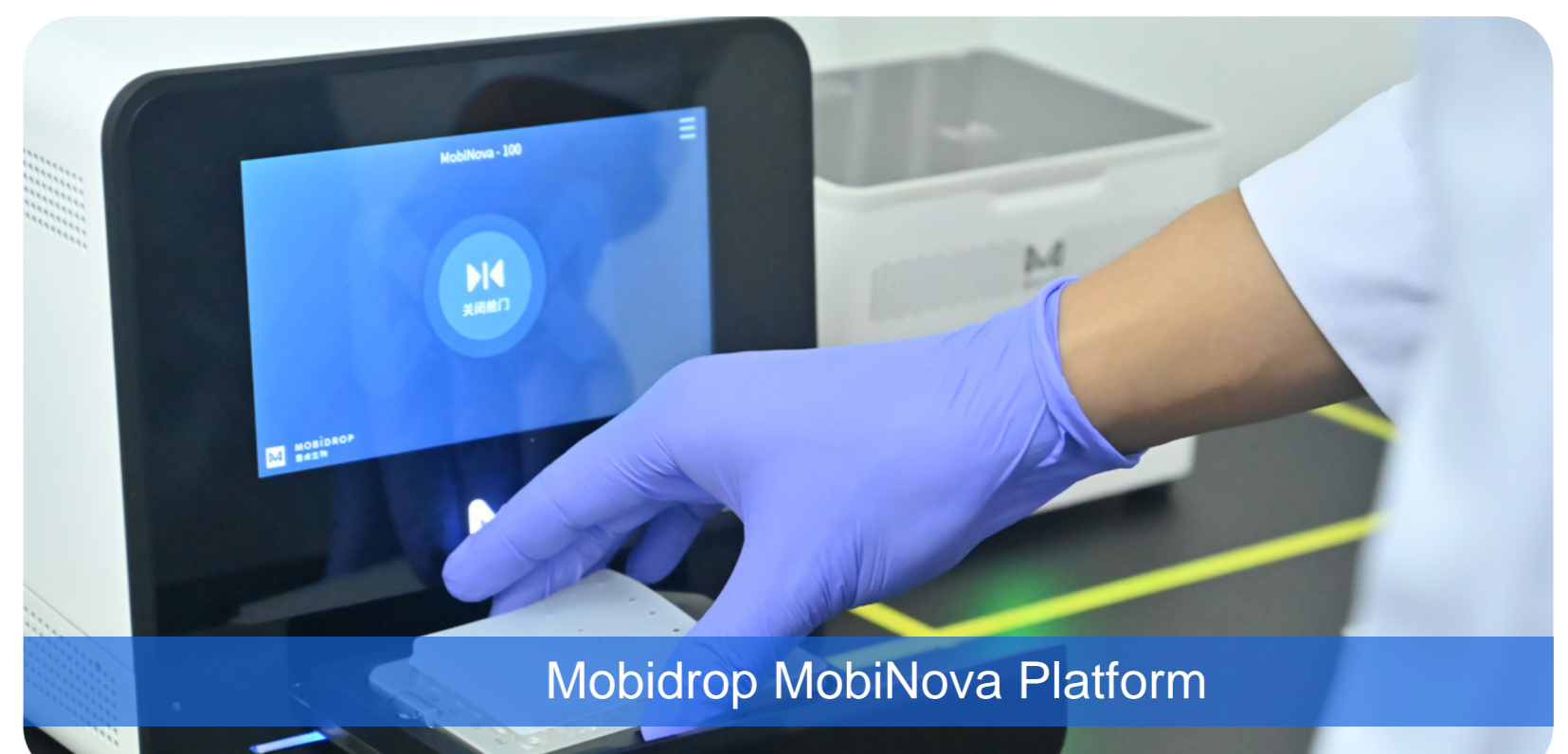
Mobicdrop MobiNova Platform