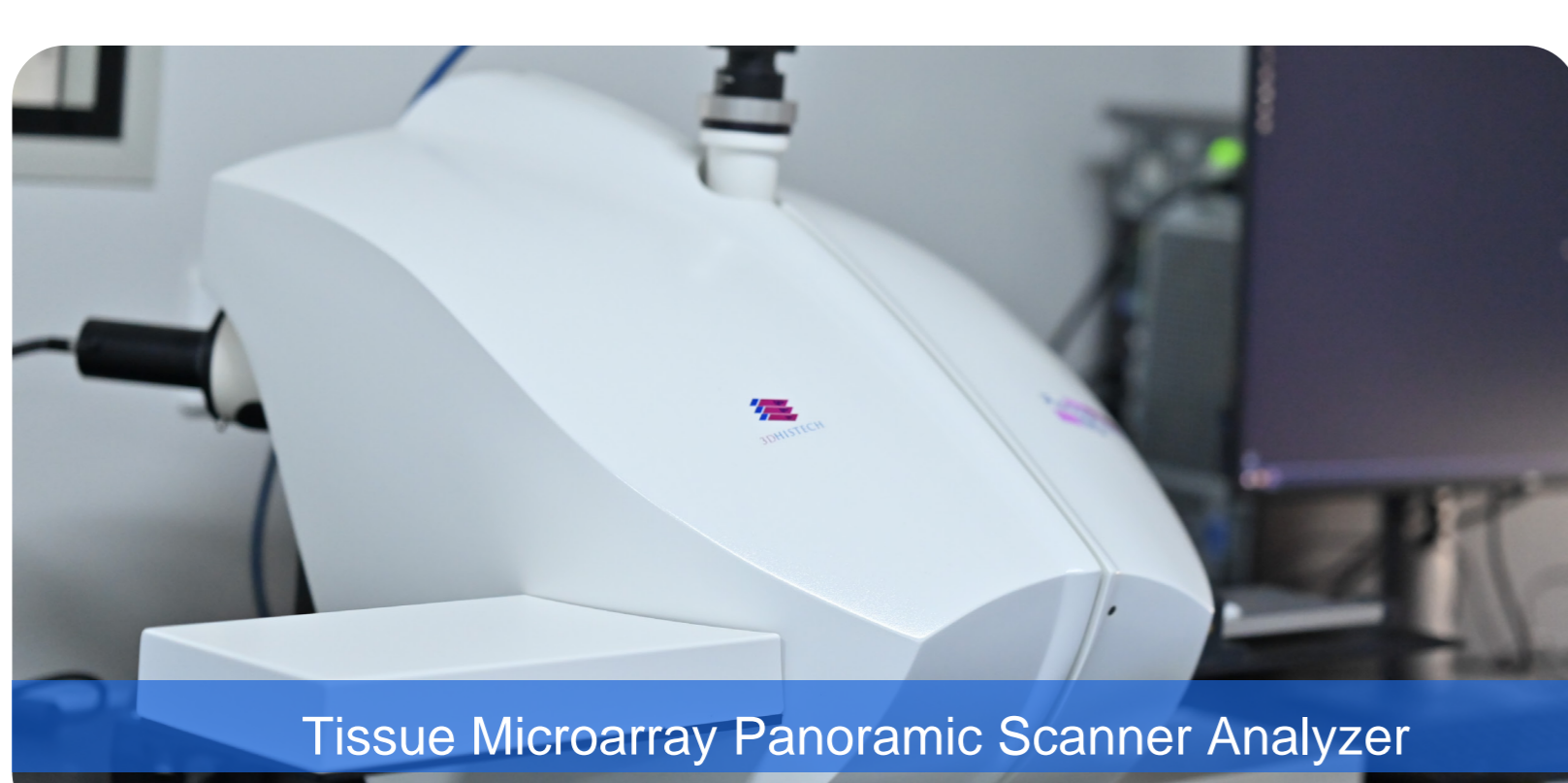
Tissue Microarray Panoramic Scanner Analyzer