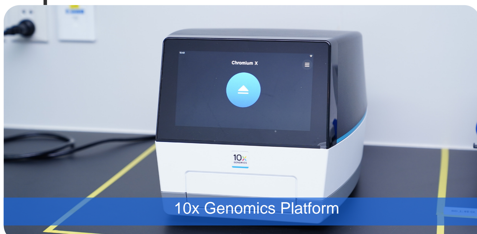
10x Genomics Platform

3 single-cell transcriptome: 10X Genomics, BD Rhapsody, MobiNova 4 spatial transcriptome: 10x Genomics Visium, CytAssist, Xenium, BGI spatiotemporal omics 2 spatial metabolome: Waters SYNAPT XS, AFADESI