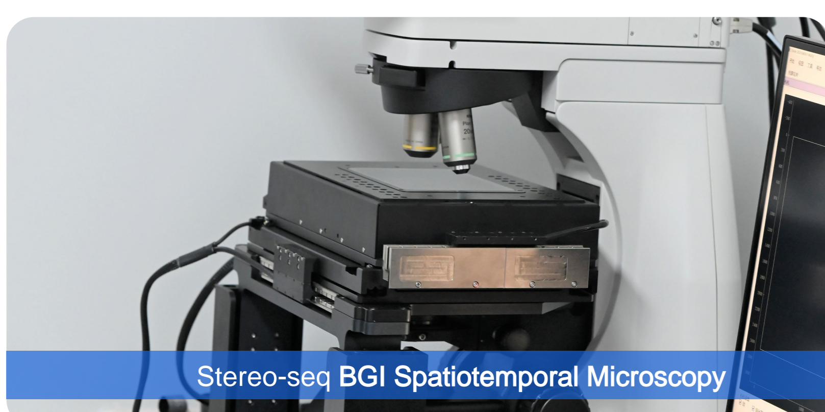
Stereo-seq BGI Spatiotemporal Microscopy