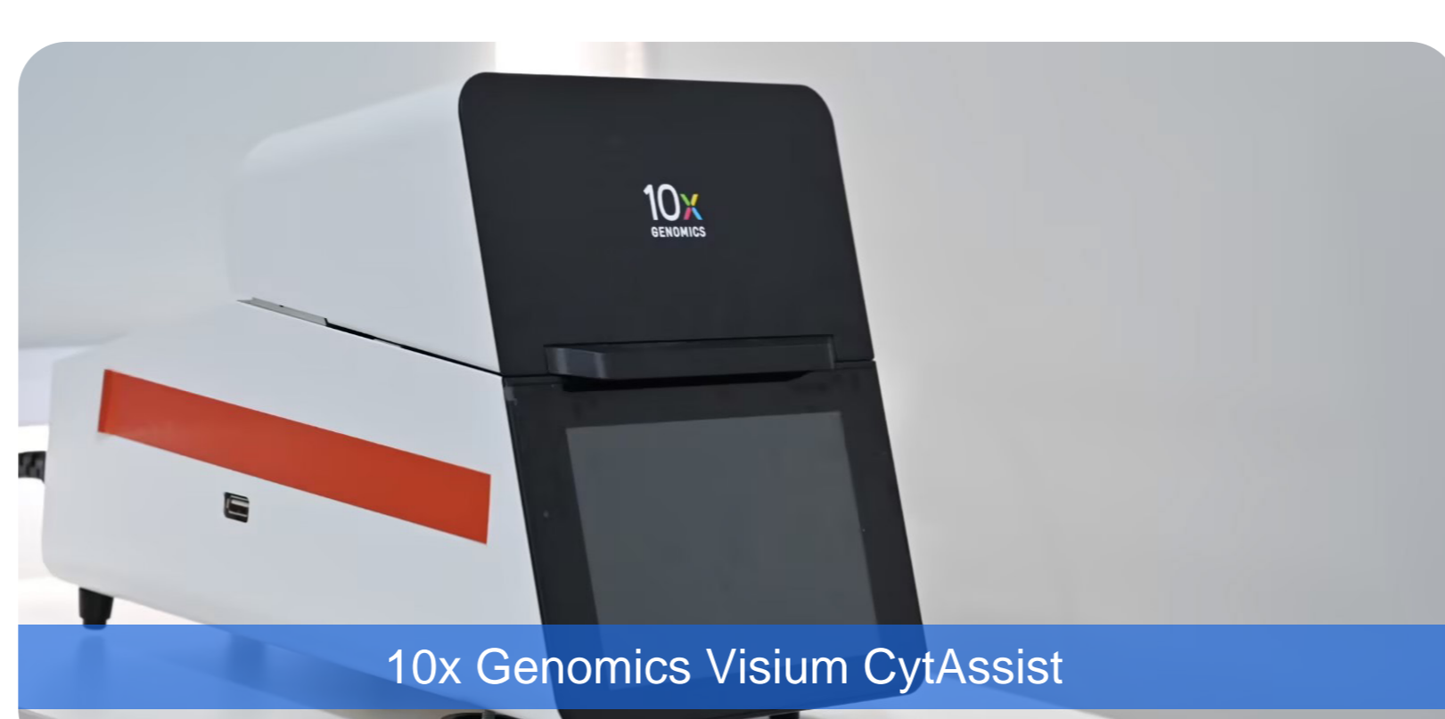
10x Genomics Visium CytAssist